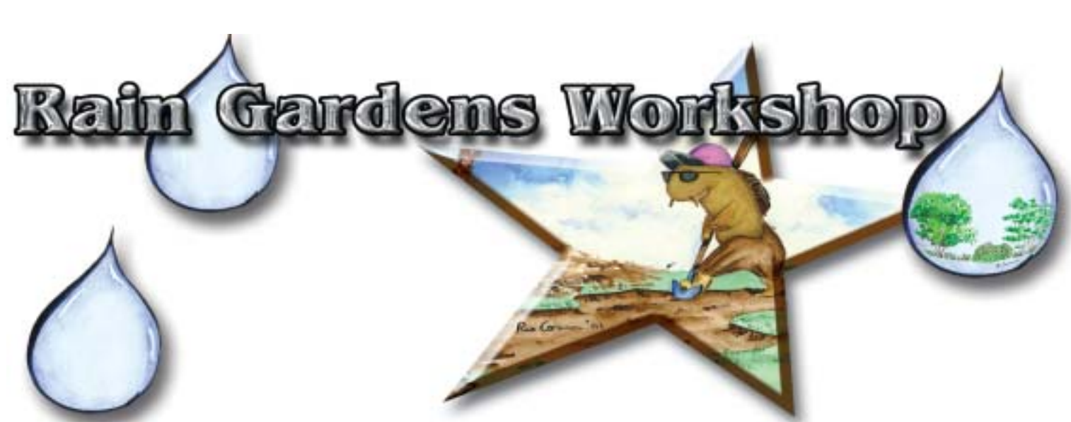
Learn how you can beautify your yard, school or business and help the environment by using Rain Gardens!

FIRST CLASS US POSTAGE PAID UPPER MARLBORO, MD PERMIT 33