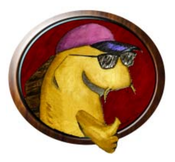
Shades says, "Volunteer to protect our streams."